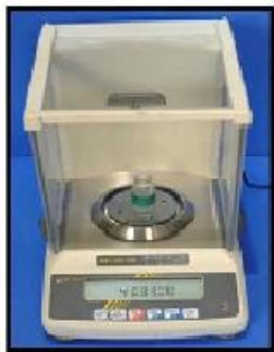
Figure 2: Sensitive electronic balance (0.00001g) (Kern-ABT 100-5M, German).

The results showed that all rotary systems applied in this study extruded debris apically; the XP-endo Shaper group showed the highest mean value of debris extruded apically with significant difference ( p < 0.001 ) compared to Hyflex EDM and WaveOne Gold groups. While the variation between the mean value of Hyflex and WaveOne Gold was a statistically non-significant difference ( p > 0.05 ).