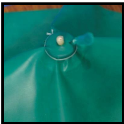
Figure 1: Coating the flask with rubber dam material, and insertion the needle through the rubber stopper.

The least significant difference test (LSD) was performed for multiple comparisons between groups (Table 3).